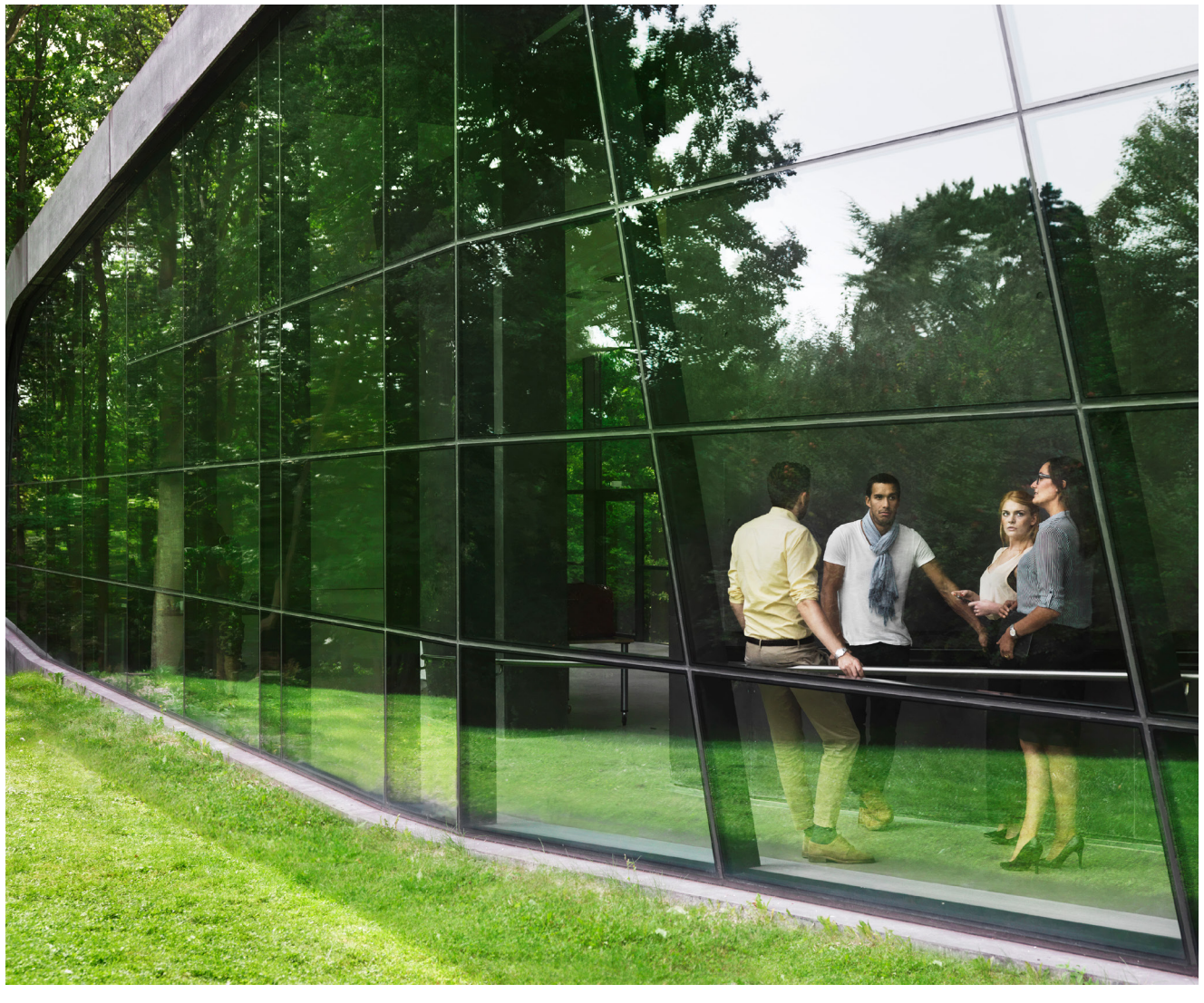
Global ESG Sourcing & Procurement Policy | 3

At a minimum, suppliers must comply with the following policies to avoid contract termination: Vendor Code of Conduct; Global Health Safety and Environmental Policy; and Vendor Due Diligence Policy.